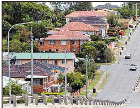
RENT BOOM: Brisbane landlords the winners.

Across the Australian capital city property market, Darwin has the strongest yields for houses (6.4 per cent) and units (6.1 per cent), while Brisbane recorded best performing unit yields of 6.4 per cent in Spring Hill and 4.8 per cent for houses at Hemmant. The report also showed that dwelling approvals had fallen 12.5 per cent during May 2009 with private dwelling approvals falling by 2 per cent.